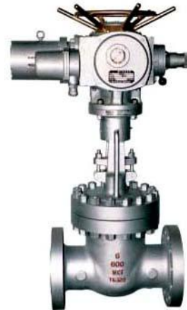
Actuated Gate Valve