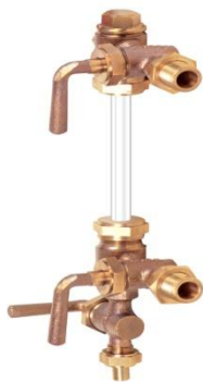
Water Level Gauge