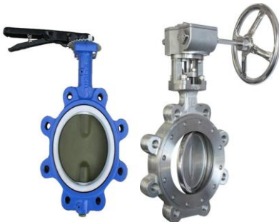
Lug Type Offset Type