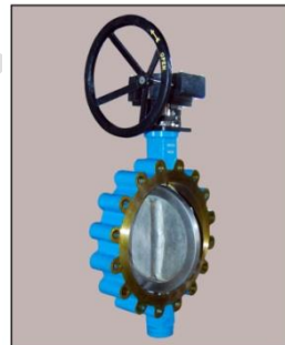
Fire safe design