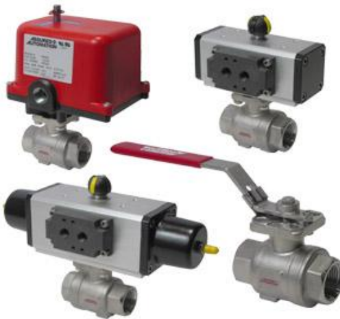
Actuated Ball Valve