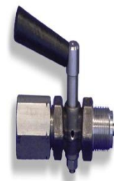
Pressure gauge Cock