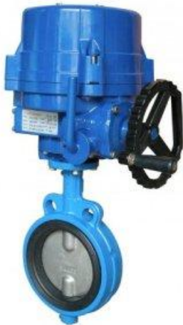
Actuated Butterfly Valve