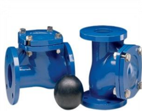
Ball Check Valve