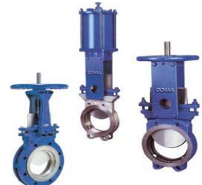
Knife Edge Gate