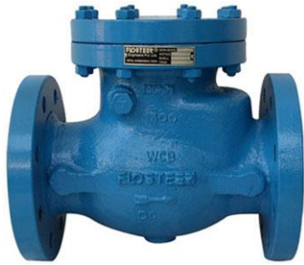
Swing Check Valve