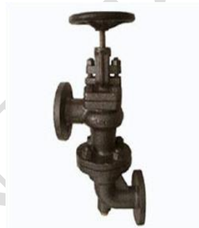
Feed Check Valve